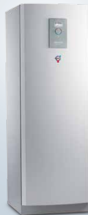
Diplomat Duo Optimum